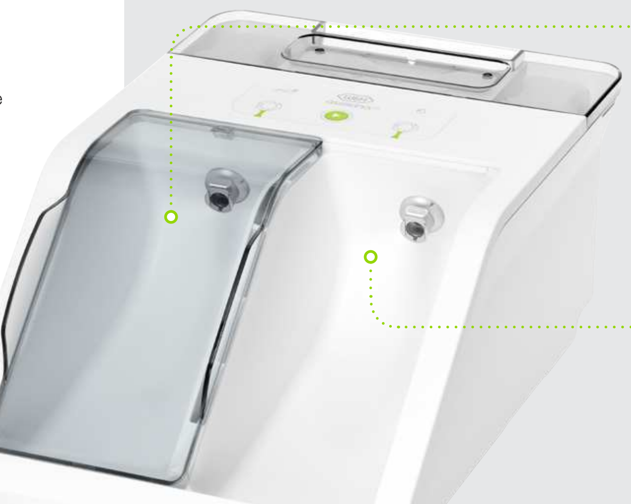
Quick RM for turbine handpieces.

Thanks to the integrated Quick Connect by W&H, the Assistina Twin fits into your processes more smoothly and makes them even more efficient. Why? Because you can equip the maintenance device with exactly the adaptors you need for your transmission instruments.