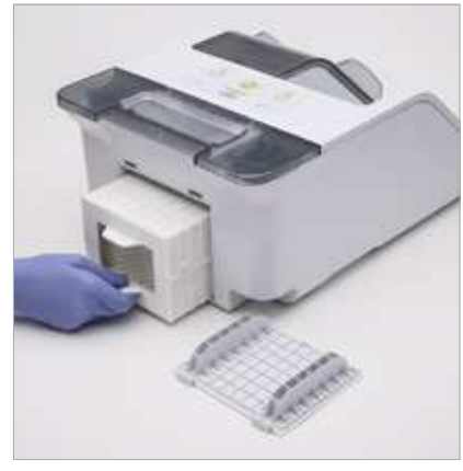
Twin Care Set Each set comprises one cartridge of cleaning solution, one cartridge of Service Oil F1 and one HEPA filter. All consumables are extremely easy to replace without a tool.