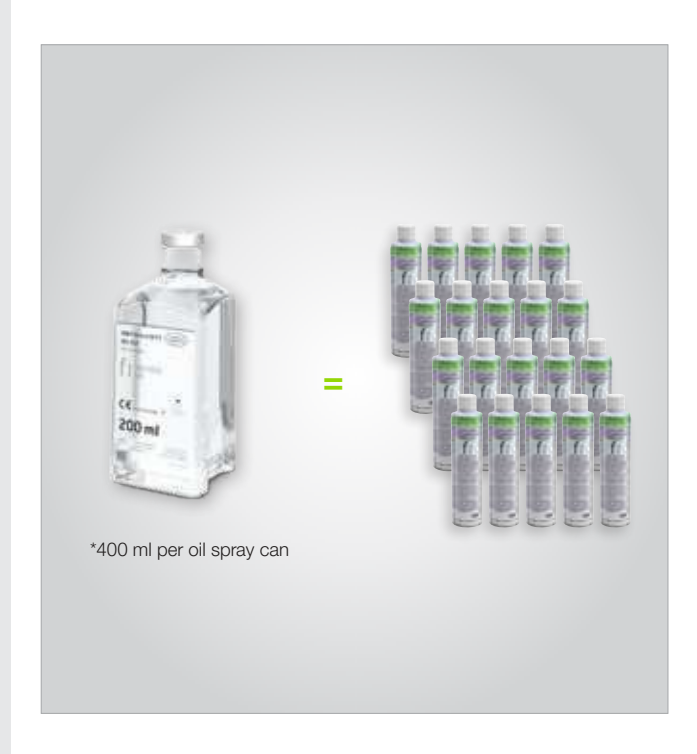
Assistina Twin Care Set yields as much as 20 oil spray cans*

Thanks to the smart process monitoring, the Assistina Twin always achieves thorough maintenance with minimum consumption. The Assistina Twin Care Set only needs to be changed after around 2,800 instruments. Your instrument maintenance is thus not just quick and reliable, but also more costefficient than ever.