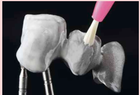
SHOFU Universal Pre-Opaque