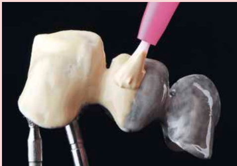
SHOFU Universal Opaque

SHOFU Universal Primer, the successor to the proven SHOFU MZ Primer Plus, is the universal solution for bonding resins to CAD/CAM metal and zirconia frameworks, thanks to its wide range of indications and quick and easy handling without any further accessories or heat treatments.