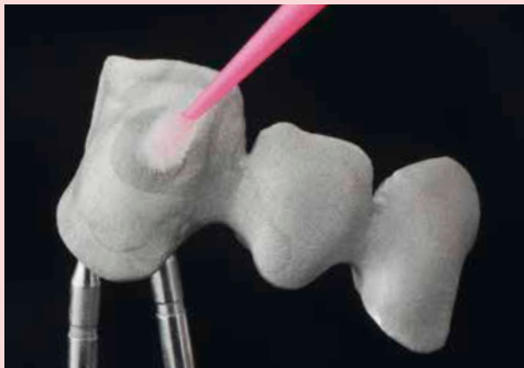
SHOFU Universal Primer