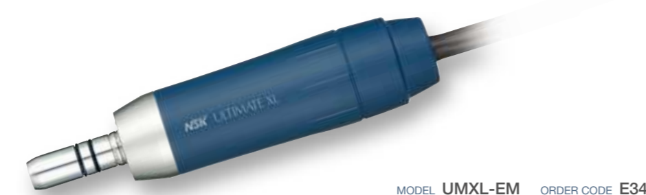
MODEL UMXL-EM ORDER CODE E342

• Dimensions: L118 x ø27 mm • Weight: 129g (cord not included) • Cord Length: 1.2 m