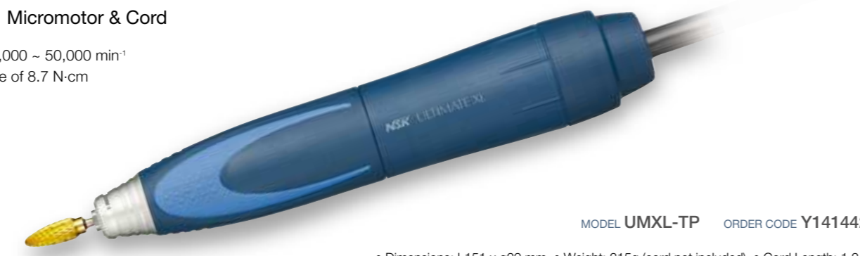
MODEL UMXL-TP ORDER CODE Y141442

• Dimensions: L151 x ø29 mm • Weight: 215g (cord not included) • Cord Length: 1.2 m