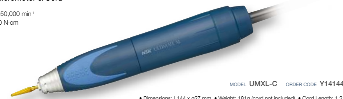
MODEL UMXL-C ORDER CODE Y141444

• Dimensions: L144 x ø27 mm • Weight: 181g (cord not included) • Cord Length: 1.2 m