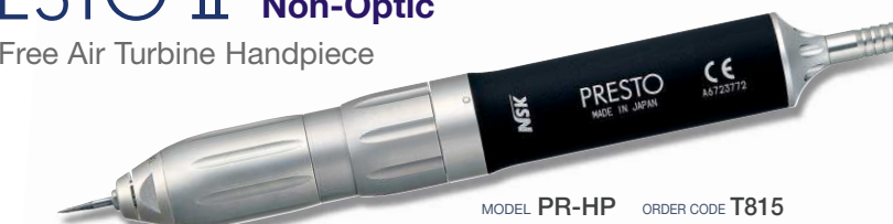
MODEL PR-HP ORDER CODE T815