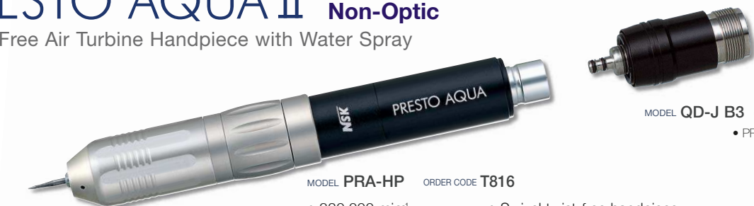
MODEL QD-J B3 ORDER CODE T354051 • PRESTO AQUA coupling

Lube Free Air Turbine Handpiece with Water Spray