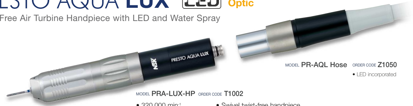
MODEL PR-AQL Hose ORDER CODE Z1050 • LED incorporated

Lube Free Air Turbine Handpiece with LED and Water Spray